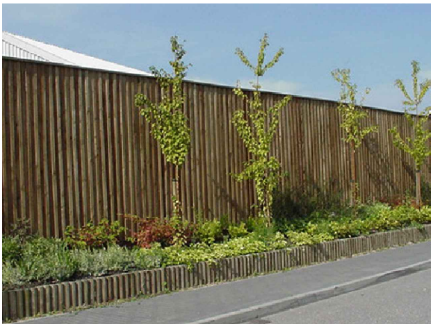
TYPICAL CLOSED BOARD FENCE IMAGE